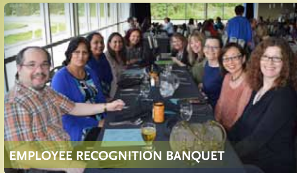
EMPLOYEE RECOGNITION BANQUET

"Rotary ramping up fundraising efforts this spring" - Peace Arch News (Mar. 8, 2016)