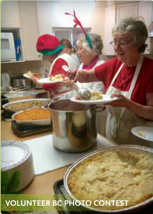
VOLUNTEER BC PHOTO CONTEST

TOP: Women's Place volunteers prepare and serve a free hot lunch to women and children in need during the holidays. This photo received honourable mention in Volunteer BC's 2016 Photo Contest, which had the theme: "Volunteers are the roots of strong communities."