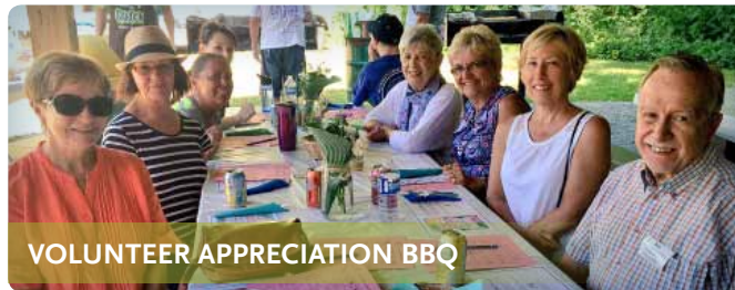
VOLUNTEER APPRECIATION BBQ

TOP: Volunteers and their families decorated our shiny new Sources Langley Food Bank truck for the City of Langley's Magic of Christmas Parade on December 5.