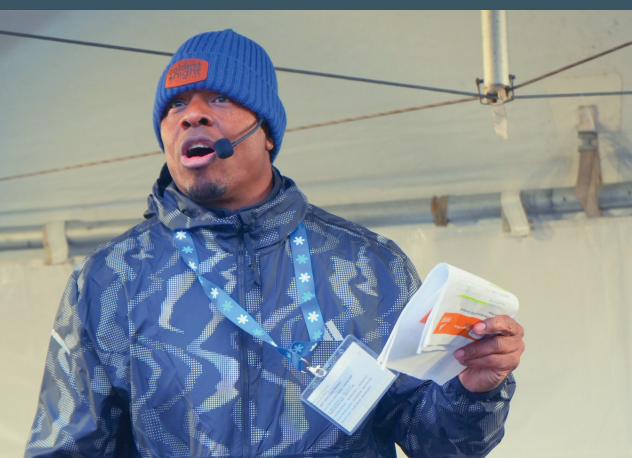
Former CFL player & celebrity fitness trainer as emcee for the evening