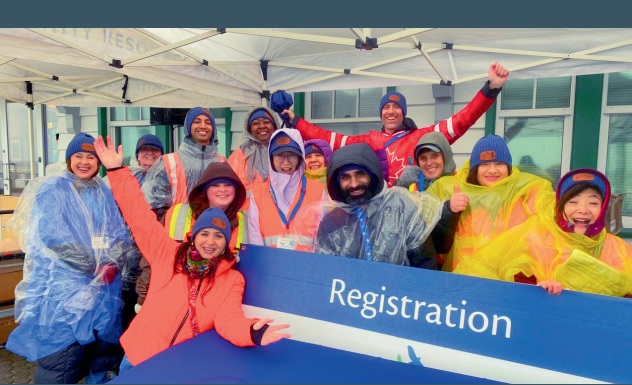
SOURCES staff and volunteers