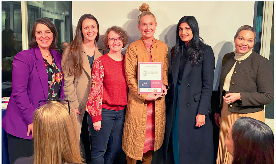
In Her Shoes Presenting Sponsor, White Rock Optometry