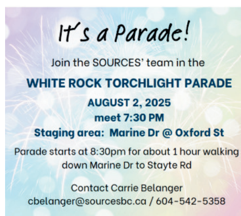
AUG 2 - WHITE ROCK TORCHLIGHT PARADE