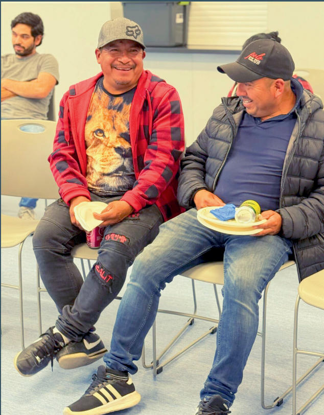
Attendees at CARES' outreach session