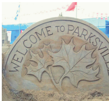
JUL 17 - SOURCES AT PARKSVILLE BEACH FESTIVAL