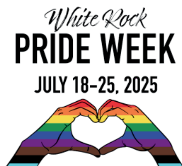
JUL 18-25 - WHITE ROCK PRIDE WEEK