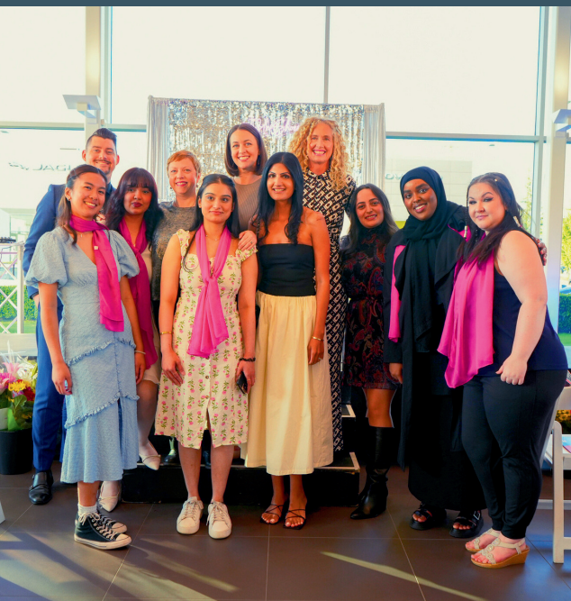
Guests and volunteers from our presenting sponsor, White Rock Optometry