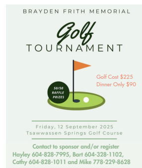
SEP 12 - BRAYDEN FRITH MEMORIAL CHARITY GOLF TOURNAMENT