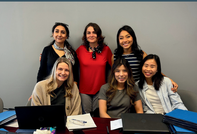
Positive Behaviour Support Services team

Positive Behaviour Support Services has now moved to Unit 101 in the the same building (13771 72a Ave, Surrey).