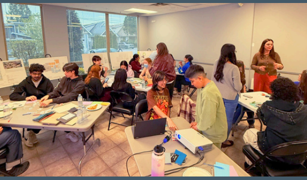
One of the many meetings of Foundry's Youth Advisory Council, featuring youth from the community