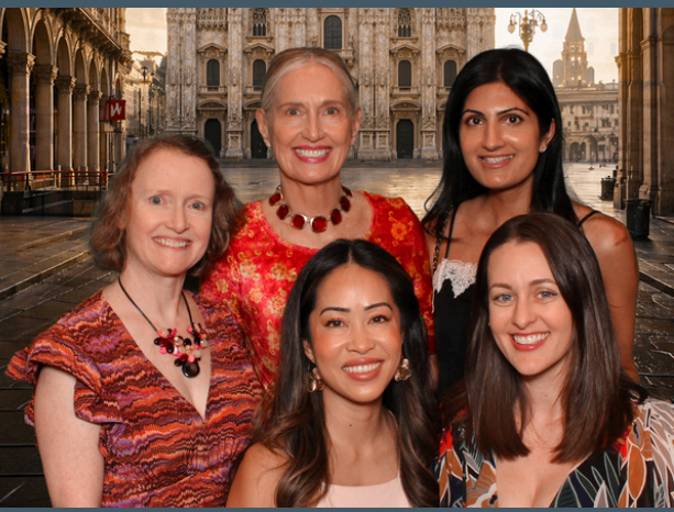
Presenting Sponsor White Rock Optometry