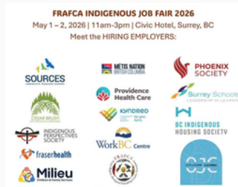
FRAFCA'S INDIGENOUS JOB FAIR 2026, MAY 1-2