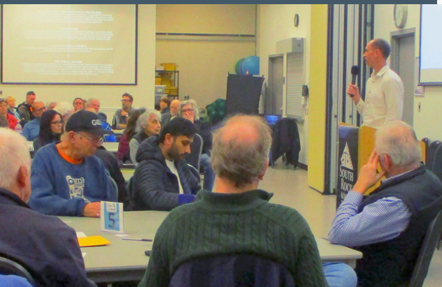
Community members gathered for Healing Begins in My Backyard, an evening co-sponsored by Tides of Change Community Action Team and the South Rock Social Justice Society. The event featured three short films highlighting the complex realities of substance use, trauma and homelessness, followed by an open dialogue.