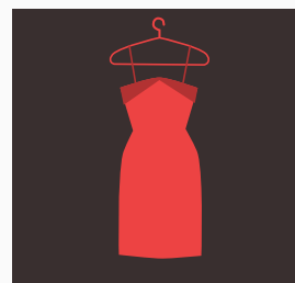
RED DRESS DAY MAY 5