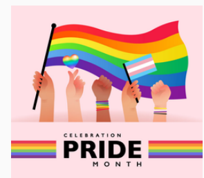
PRIDE MONTH JUNE